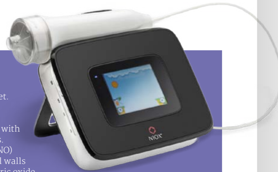
Above: FeNO testing device

Some of the more common problems that trigger a chronic cough include nasal problems, untreated infection, acid reflux or asthma. Treatment targeting these problems doesn't always help the cough go away. This can lead to patients being treated unsuccessfully again and again, resulting in frustration with the lack of progress.