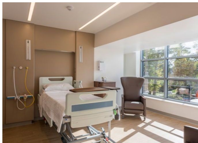
▲ Harefield Hospital spacious private in-patient rooms